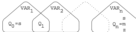
Figure 5.277: Hypergraph of the reformulation corresponding to the automaton of the global_contiguity constraint